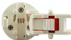
SMS1_IQF Top View